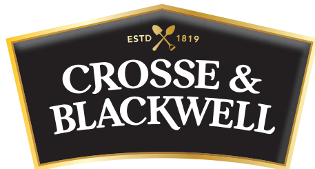
New Crosse & Blackwell logo

This is when we created the above the line campaign, including: TV, radio, print, 6 sheets at supermarkets and digital content.