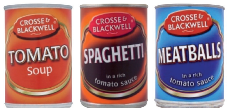
Crosse & Blackwell products before the rebrand.

We went back to the roots of the brand, unearthing a rich heritage spanning over 250 years. We discovered that the simple facts about Crosse and Blackwell's products tell a story about the brand that speaks to today's consumers – a true story about real farmers, traceable British produce, and heritage.