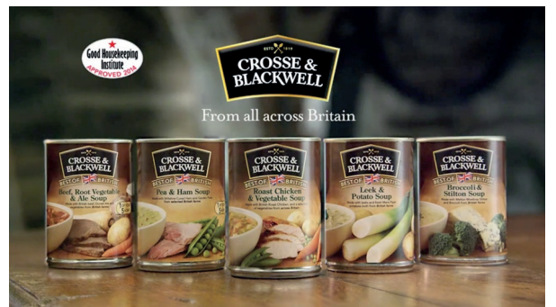
Crosse & Blackwell TV advertising