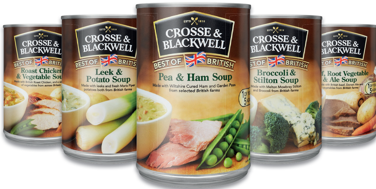
Crosse & Blackwell products after the packaging rebrand.